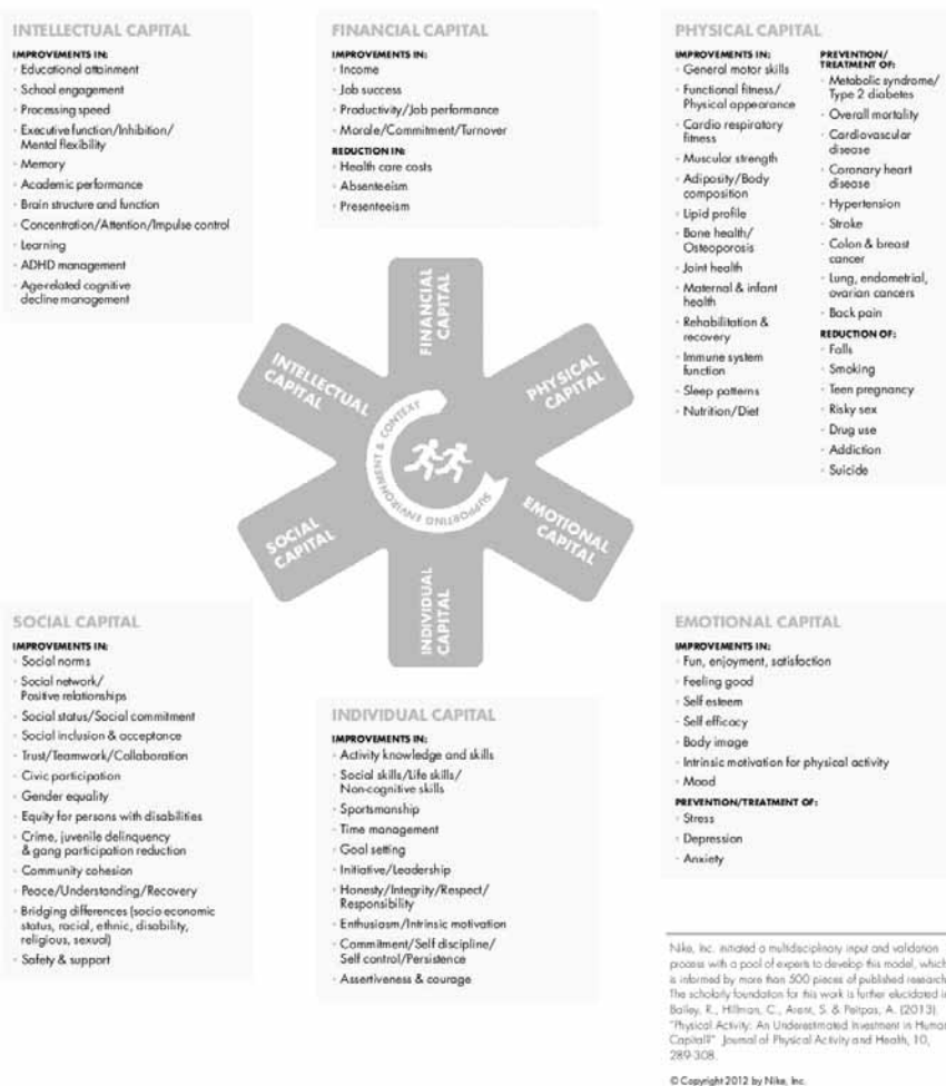
Figure 1: The Human Capitals

The comprehensive benefits of physical activity, sports and physical education are underestimated today. This model shows the spectrum of benefits to an individual and economy. Each “capital” refers to a set of outcomes that underpin our well-being and success.