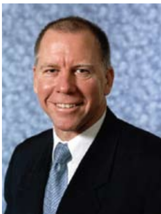
HON. ROD WELFORD MP

Minister for Education, Training and the Arts