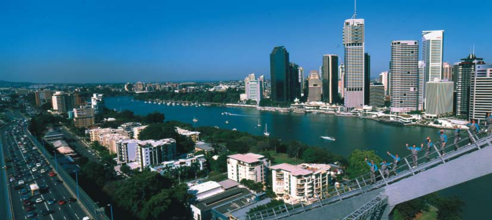
Brisbane City View from Story Bridge