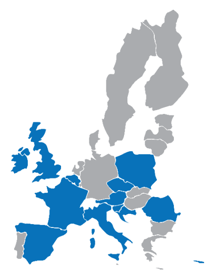
Figure 3. Explicit references to forms of gender-based violence in sport in policies of EU Member States

Various policy documents from across different sectors make explicit reference to forms of gender-based violence within sport. These are described below. They include national strategies, programmes, action plans, or codes of ethics within the policy areas of sport, gender equality, and child protection. There are also numerous examples of initiatives that have been established to raise awareness of gender-based violence in and through sport. Other relevant initiatives to combat gender-based violence in sport were developed by sport and civil society organisations. These are discussed in Chapter 6.